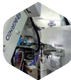
AEROSPACE & DEFENCE