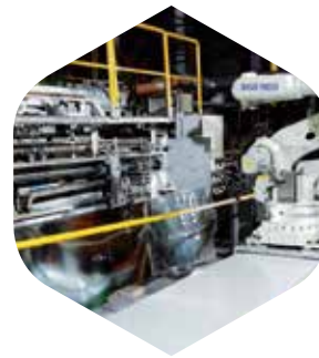
STEEL & INFRASTRUCTURE