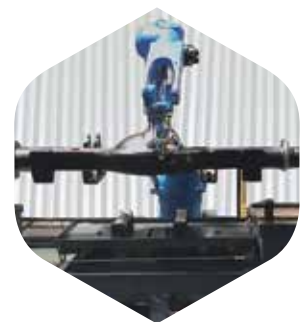
FORGING & FOUNDRY