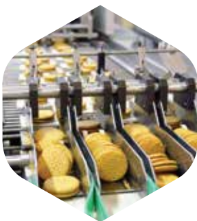
PHARMA, FOOD & BEVERAGES